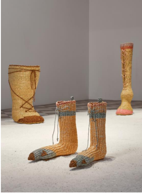
Young In Hong, Ring of Animals , 2023 Image courtesy: Kunsthal Extra City and Young In Hong / Photo: We Document Art