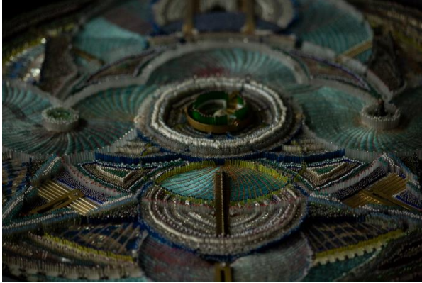
Kobayashi Nanao, Energy of Dragon , 2021