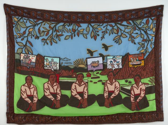
Güneş Terkol, Hopes from Mothers , 2024