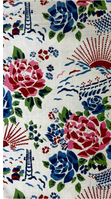
Power station-themed printed fabric, 1960s