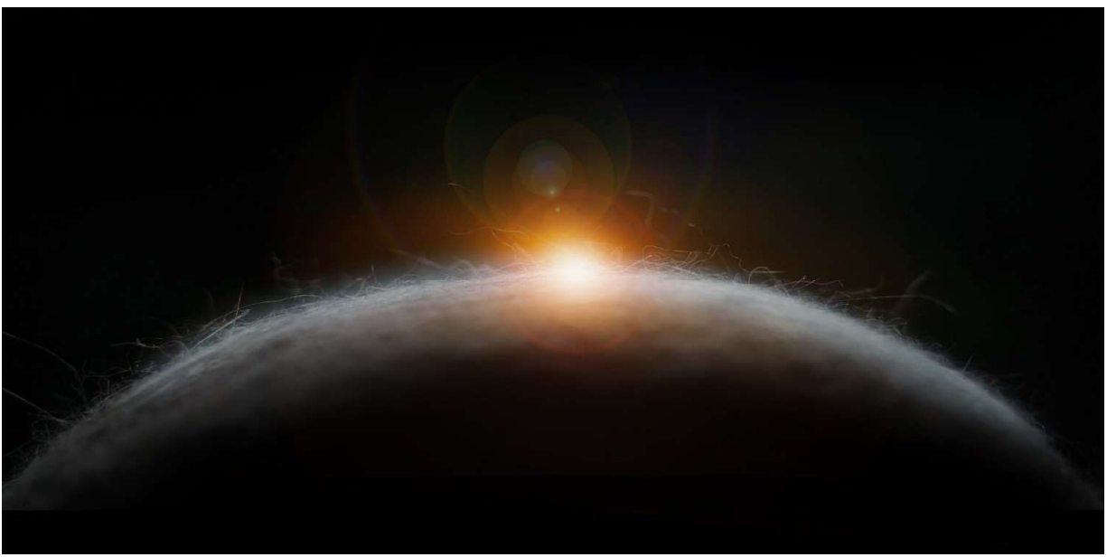
Kingsley Ng, 33.8 Hz, 2024 (Video still)

From a symphony of sound and light to various chances to co-create a multimedia production, CHAT's Summer Programme 2024 will have something for everyone