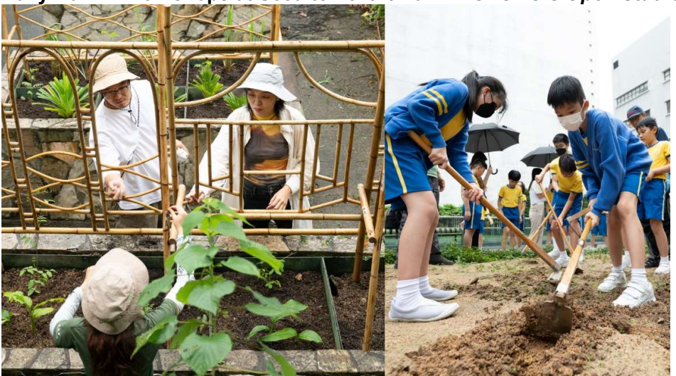
BOLOHO and Seeders from local schools grow natural dye plants and edible plants

This year, CHAT's annual flagship community programme Seed to Textile showcases the collaborative efforts of BOLOHO, the CHAT artist-in-residence, and members of the public. Delving into the intertwined narratives of overseas Chinese farms and Hong Kong's rich migration history, the artist collective shares their artistic realisation through landscape sculptures, collective planting and art making, and the resulting multimedia work.