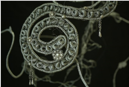
Shao Chun, Forgotten Moon , 2024; Image courtesy: Shao Chun