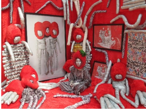
Kobayashi Yuki, Factory of Universe , 2024