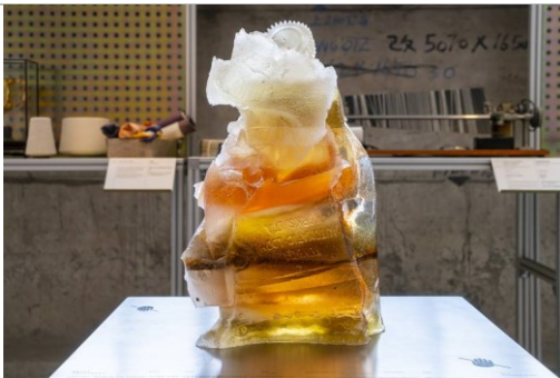
Park Jeehee, Drawing Elliptical Orbit (when the half-moon sets in late summer) , 2022