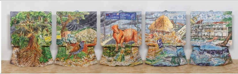
Yuki Kihara, サモアのうた ( Sāmoa no Uta ) A Song About Sāmoa - Fanua (Land) , 2021; Image courtesy: Yuki Kihara and Milford Galleries, Aotearoa New Zealand